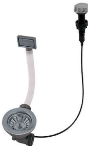
Gun Metal automatic waste fitting